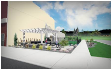
Screenshot (4).png 3568K