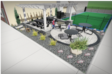
Screenshot (9).png 2301K