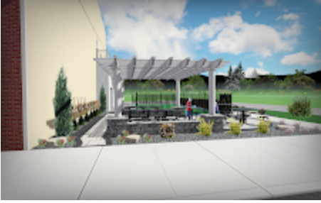
Screenshot (5).png 3902K